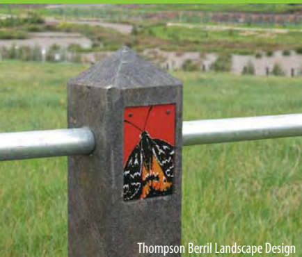
Thompson Berrill Landscape Design